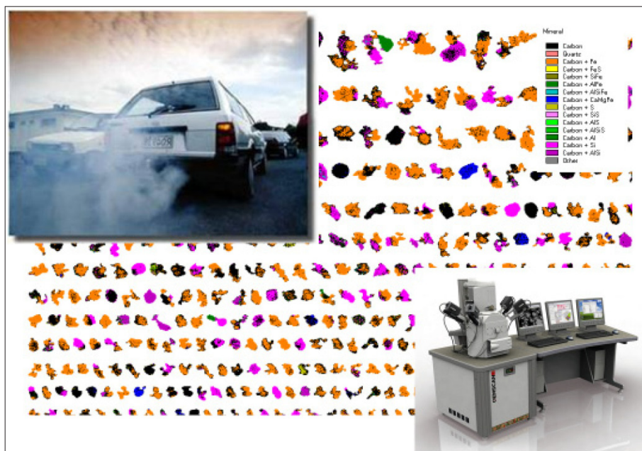
Figure 1: Example of dust sample collected from a motorway tunnel.

This capability is enhanced further by the SGS' world-class team of mineralogical experts who ensure both a quality product and, for every project, provide significant interpretive value addition to the High Definition mineralogy product. Other environmental services can be also obtained from the network of associated SGS laboratories.